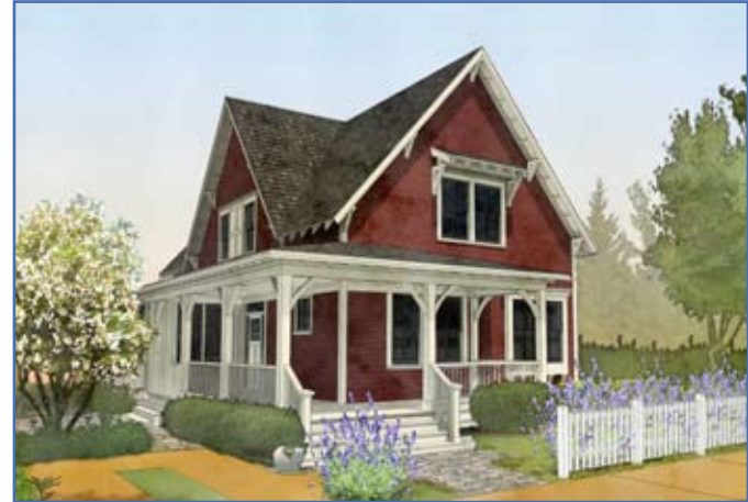
REID HARBOR - OPTION B

Note: Plans and details subject to modification.