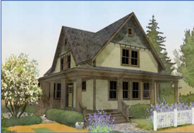
REID HARBOR - OPTION A