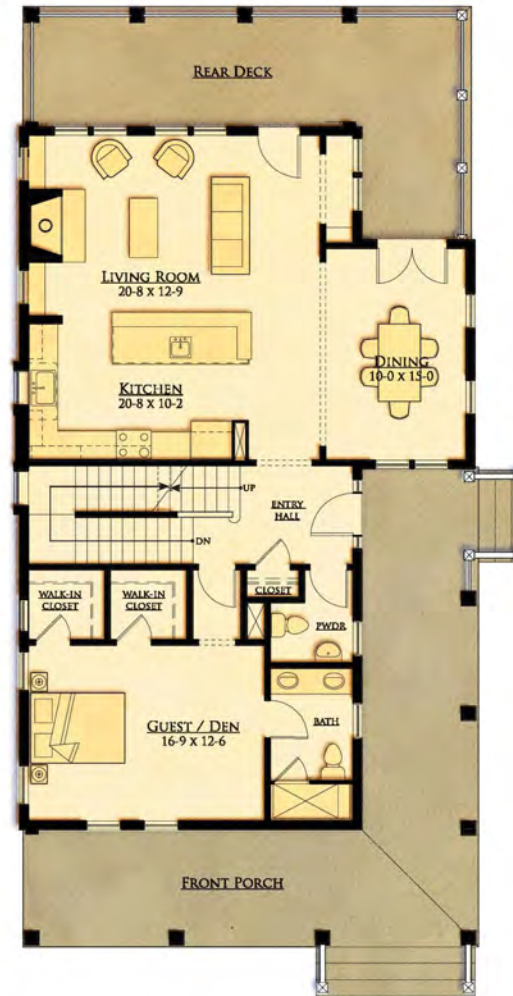
FIRST FLOOR PLAN - 1316 SF