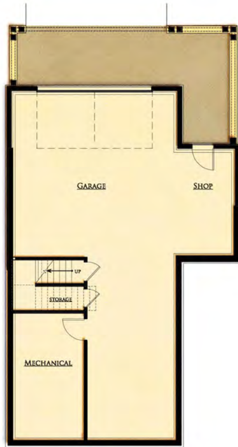
GROUND FLOOR PLAN - 1246 SF